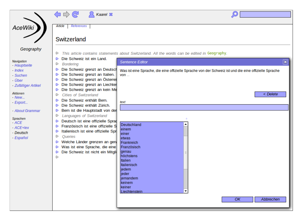
Figure 1: Multilingual geography article about Switzerland displayed in German. The user can change the language of the wiki (both the content and the user interface labels) using the language switching menu in the left sidebar. Otherwise the user interface is identical to the AceWiki user interface with the familiar look-ahead editor that helps users to input syntactically controlled sentences.

the ambiguity is preserved. If viewed in another language, multiple different sentences can then occur as linearizations of the ambiguity. This allows wiki users who work via the other language to resolve the ambiguity. A monolingual way to deal with ambiguity is to implement for every concrete syntax an additional "disambiguation syntax" [RED12] that overrides the linearizations of the ambiguous constructs to have an unambiguous, although possibly a more formal-looking notation. This syntax could be used to display the entry in the case of ambiguity.